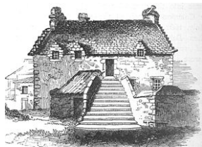
Broughton Tolbooth 1582-1829