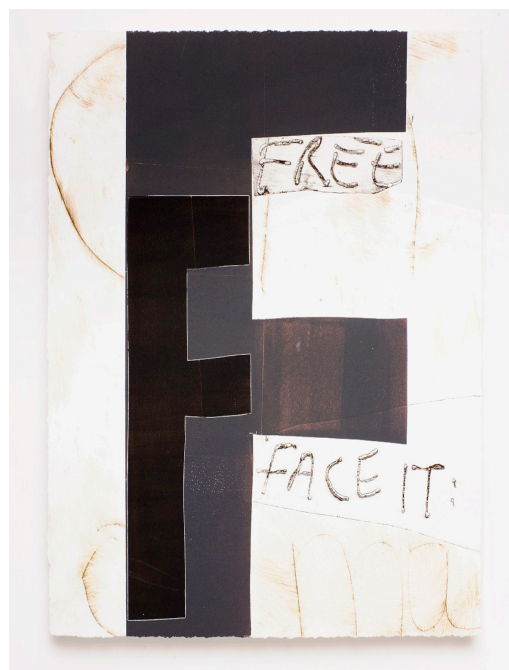
Image Credit: Magne F, Alpha-Beta 'F', 2009, Monotype with Drypoint, Ed. 46, paper size 31 x 31cm, Published by Paul Stolper, London.

An interesting exhibition of artwork by Magne Furholmen (now known as Magne F), former keyboard player with the 1980s group A-ha, is running at Edinburgh Printmakers in Union St. Thirty works in drypoint and monotype illustrate each letter of the alphabet as well as specific Norwegian letters. The exhibition continues until 6 March.