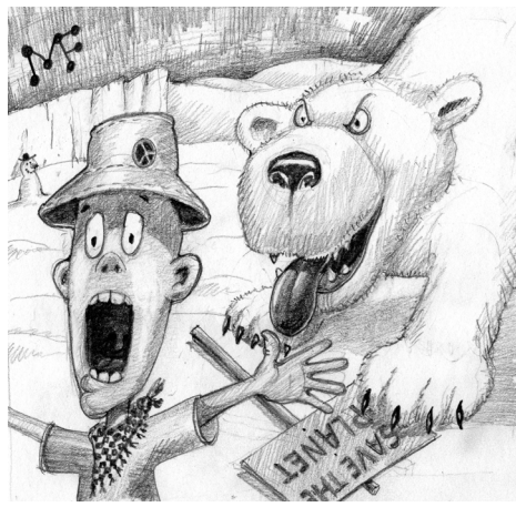
Activist regrets cold snap