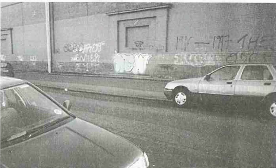
Graffiti in Green Street. Elsewhere in Broughton graffiti on the Cochran Terrace corner was getting worse and worse. Then one Monday the whole wall was repainted – only to be defaced again by the following Sunday! Another current hotspot for graffiti is Annandale Street Lane – where garage doors and a nursery school are the victims. What can be done?

Spurtle has raised questions through our local councillor, and we've just received some preliminary answers – which suggest further questions! We'll return to this subject next month.