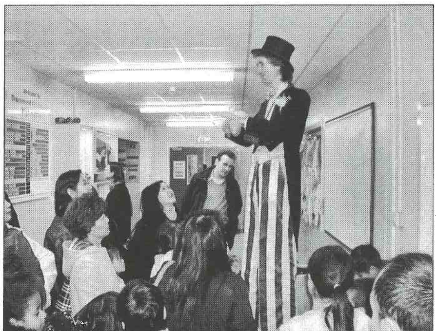
Drummond Community High School held its sixth annual 'Festival of Learning' on 12th March. A free event for the whole school and local community, there were adult education 'taster' workshops, exhibitions, live music and stage performances.

'It is six years since the Action Plan was adopted and what has happened since then is that unemployment has fallen dramatically in Edinburgh. So the need for "employment generating