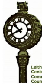
Leith Central Community Council

A forum for local people who want to engage with and work for their local community.