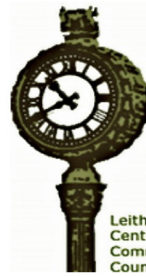
Leith Central Community Council

A forum for local people who want to engage with and work for their local community.