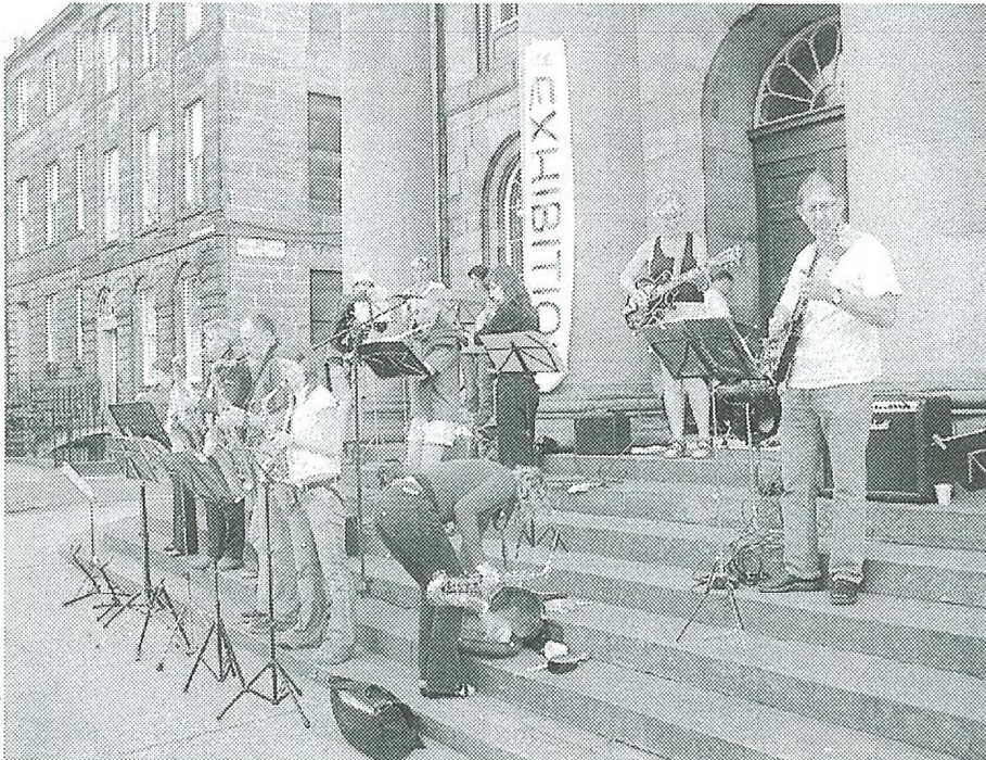
Drummond Community Big Band played for the opening of the history exhibition back in August. Plans for the Church building mean it will be an even better local resource in the future.