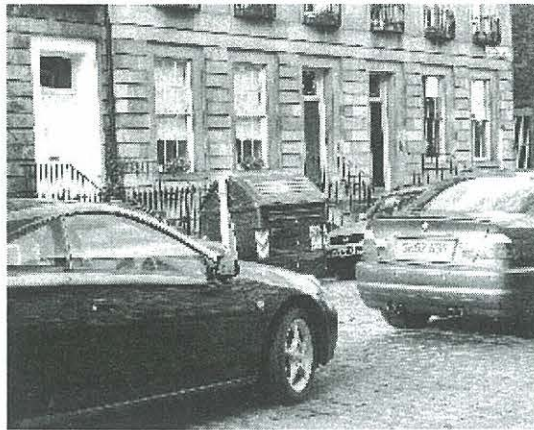
Since wheelie bins arrived in East Claremont Street some drivers have started parking in the centre of the street

Loss of parking spaces to make room for the bins is perhaps the main cause of discontent. Since they were installed some drivers have begun to park in the centre of the street, beyond the end of the central island. As we go to press, we understand the police have put warning notices on some windscreens but have not yet removed offending vehicles.