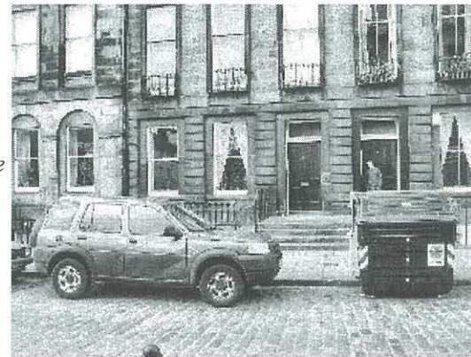
Some parked vehicles are bulkier than the 'giant' bins