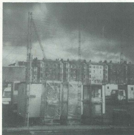
Proposed site from Hopetoun Street