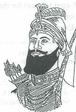
Guru Gobind Singh - see back page.

He regrets not being able to start in Drummond with a broad, generous outlook, rather than the 'penny-pinching' attitude that he has been forced to take towards such budgets as lighting and heating. He says that despite talk about cash targets and lists of figures, in the end it comes down to people. Inevitably some people who have worked hard and shown commitment will have to leave Drummond or have their time cut.