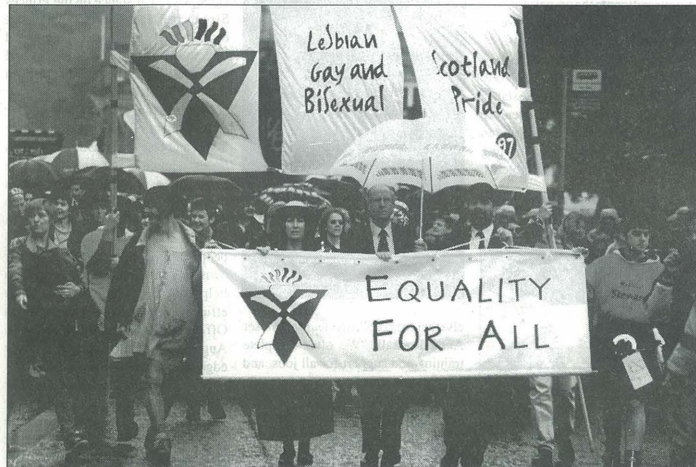
Out and Proud! Pride Scotland set off from East London Street to march to the Meadows.