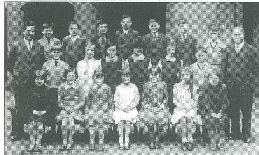
St. James' Episcopal School in Broughton Street, sometime in the 1930s - where the Stafford Centre is today.

Broughton Spurtle is free and completely independent