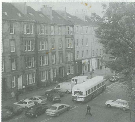
Bad parking in Broughton!

And we haven't started on vehicles going the wrong way along one-way Hopetoun Crescent. But that's for another time. Tell Spurtle about your least favourite black-spot. You never know, we might get somewhere eventually.