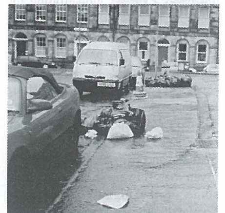
Jean Bell of Bellevue Street wrote to us about litter round the corner in Melgund Terrace, with photos taken on a Sunday to illustrate the mess. "The bag uplift had taken place, as usual, around 7.30am on the previous Friday, and the next uplift was due on Tuesday. This lot started collecting on the Friday night." Some of the rubbish is brought from elsewhere, and dumped beside the bin outside the corner shop.