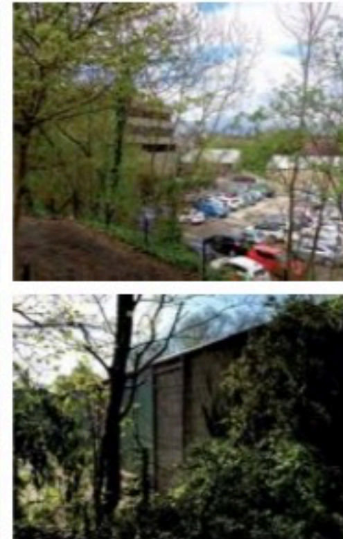
EYRE PLACE & EYRE TERRACE