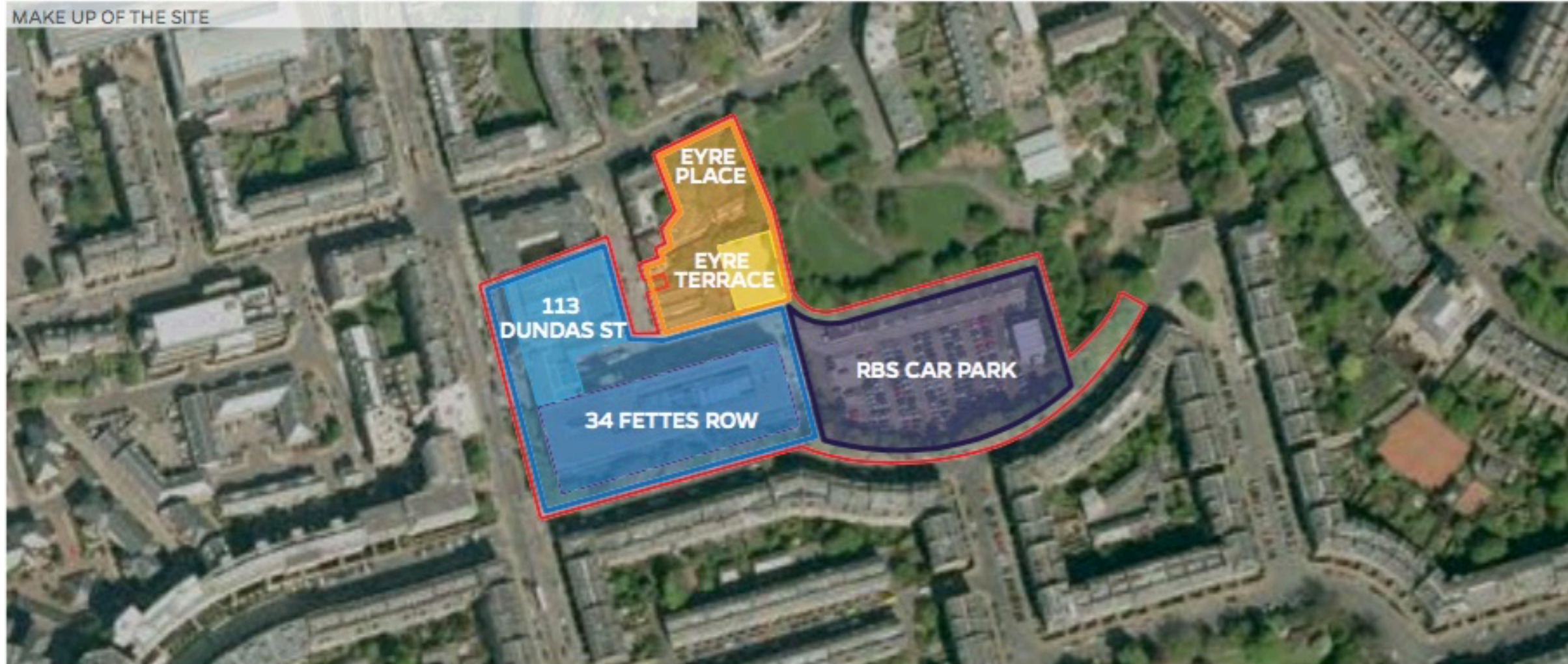
MAKE UP OF THE SITE

The site currently comprises the following: